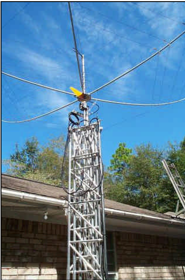
Figure 1. HX-5B Hex-Beam at W2GFF.