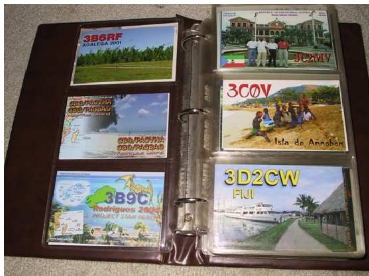
DXCC Photo Album

purely a personal preference. Some people sort strictly by DXCC country (me), or by Prefix (e.g., Jerry, N4NO), or by band. You will need some 4" x 6" card files to cleanly sort you cards. You may also want to think about how to store/organize your awards. You will eventually not be able to put all of your awards in frames and display them on the wall. There are lots of products at your local office supply store to help display, organize, and store you QSL cards and awards.