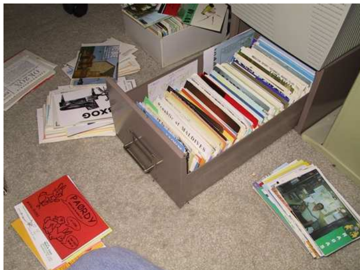
QSL Card File